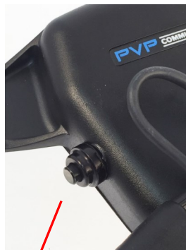
Radio PTT range to 300 ft